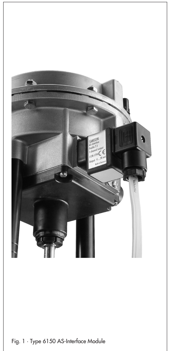
Fig. 1 · Type 6150 AS-Interface Module