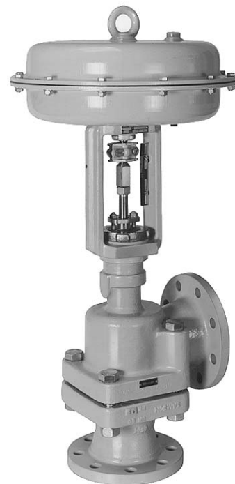
Fig. 1 · Type 3258-1 Pneumatic Control Valve